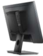
OPTIPLEX MICRO ALL-IN-ONE MOUNT FOR DELL E SERIES MONITORS

Small footprint mounting solution adapts to your environment, with cable management and monitor height adjustability, tilt, swivel and pivot functions.