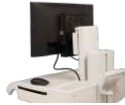
OPTIPLEX MICRO DUAL VESA MOUNT WITH ADAPTER BRACKET

This mount allows the Micro to be VESA mounted to select Dell E Series displays.