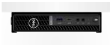
OPTIPLEX MICRO VESA MOUNT WITH ADAPTER BRACKET

Mount your system on a wall or under a surface with a VESA-compatible DVD+/-RW enclosure with full optical drive access. Includes an adapter box to securely house the system's power adapter.