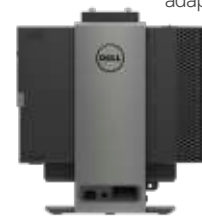
OPTIPLEX SMALL FORM FACTOR ALL-IN-ONE STAND (COMING SOON)

Minimize your footprint with this arm that offers easy installation and enhanced adjustability while keeping cables neatly hidden from view.