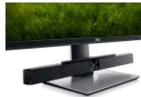
DELL PROFESSIONAL SOUND BAR - AE515M

Optimize your workspace with this efficient 21.5" monitor built with an ultrathin bezel, a small footprint and comfort-enhancing features.