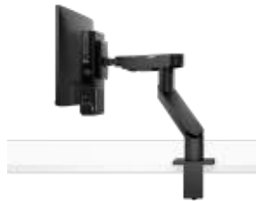
DELL SINGLE MONITOR ARM - MSA20

Mount your system on a wall or under a desk. Includes an adapter box to securely house the system's power adapter.