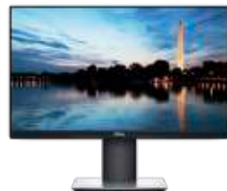
DELL 22 MONITOR - P2219H

23.8" ultrathin bezel optimized for dual display productivity. Easy Arrange feature enables multitasking efficiency and its small base frees valuable workspace.