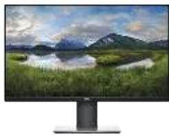
DELL 24 MONITOR - P2419H

23.8" ultrathin bezel optimized for dual display productivity. Easy Arrange feature enables multitasking efficiency and its small base frees valuable workspace.